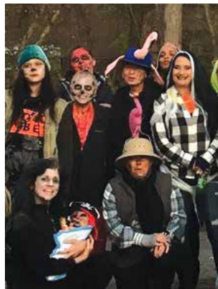
Friends of Glenbeigh dressed for an evening of trick or treat fun at Ellsworth Acres.